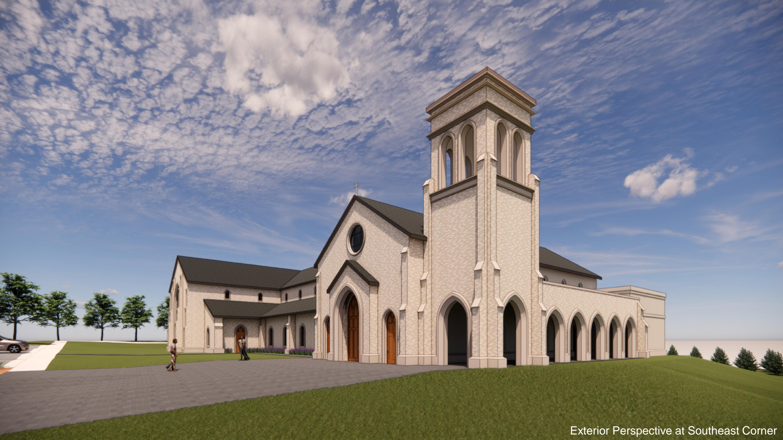
Exterior Perspective at Southeast Corner