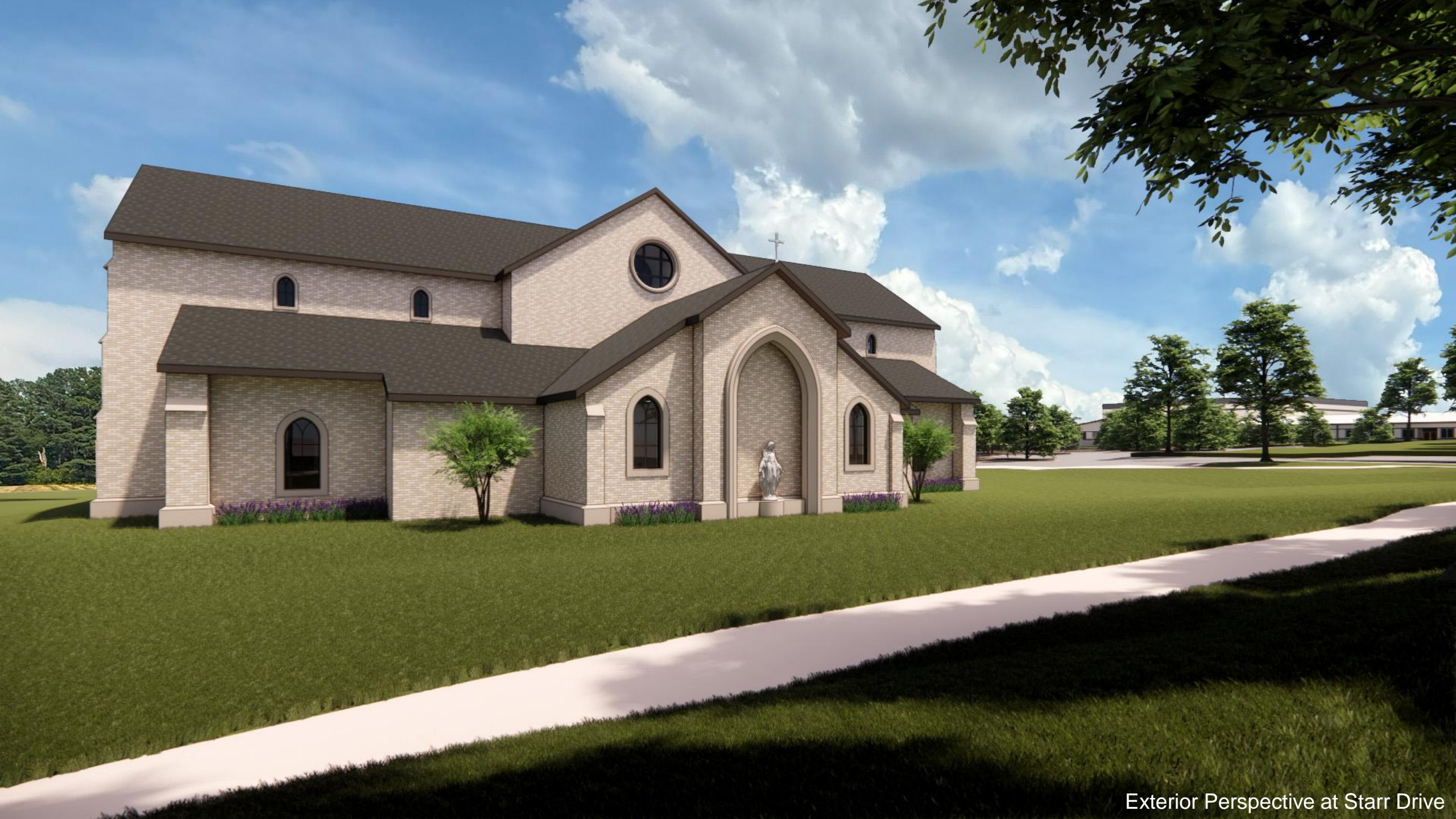
Exterior Perspective at Starr Drive