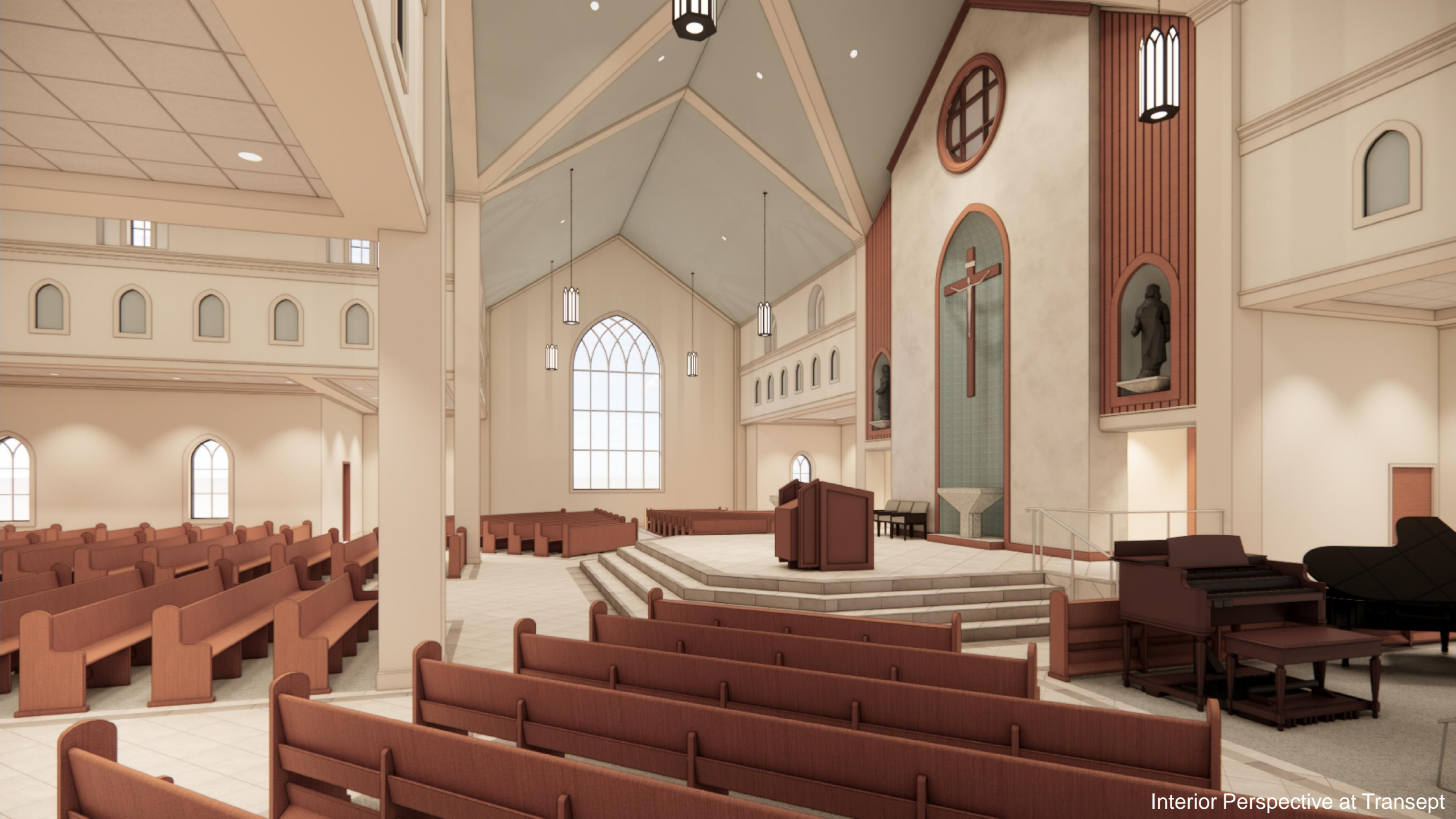
Interior Perspective at Transept