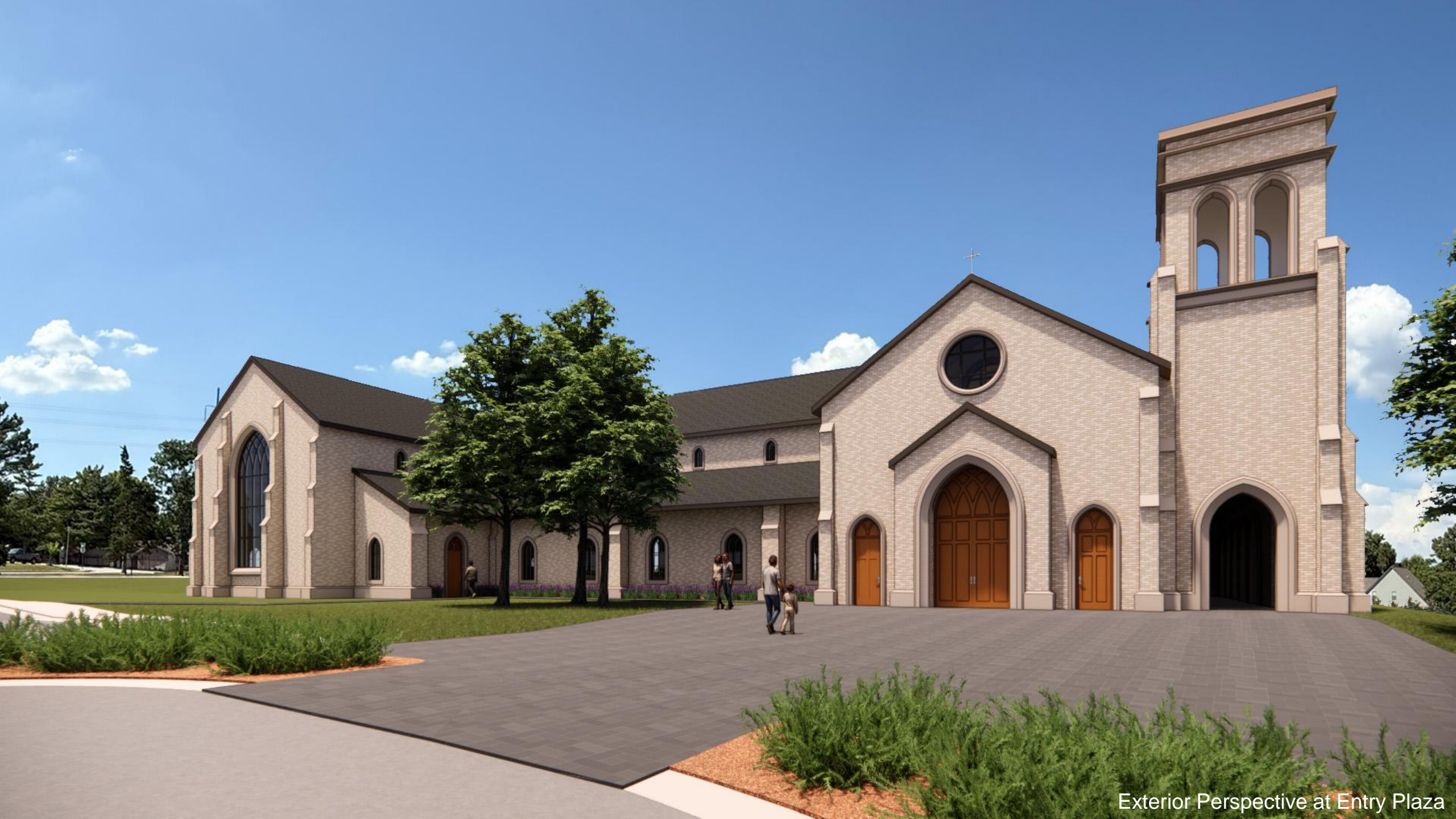
Exterior Perspective at Entry Plaza