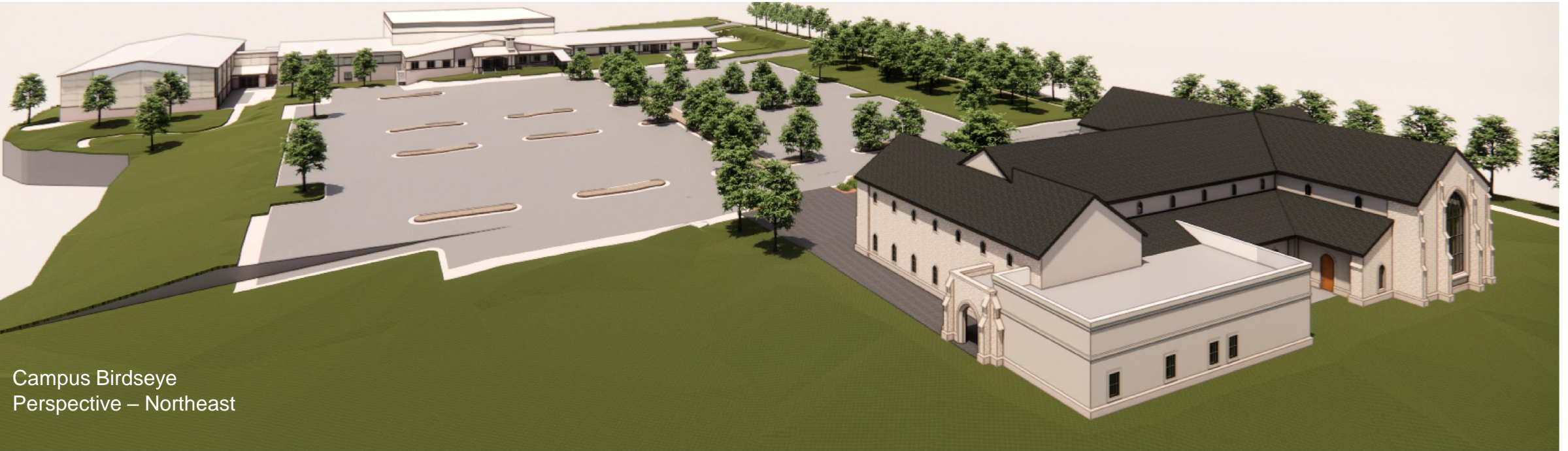
Campus Birdseye Perspective – Northeast