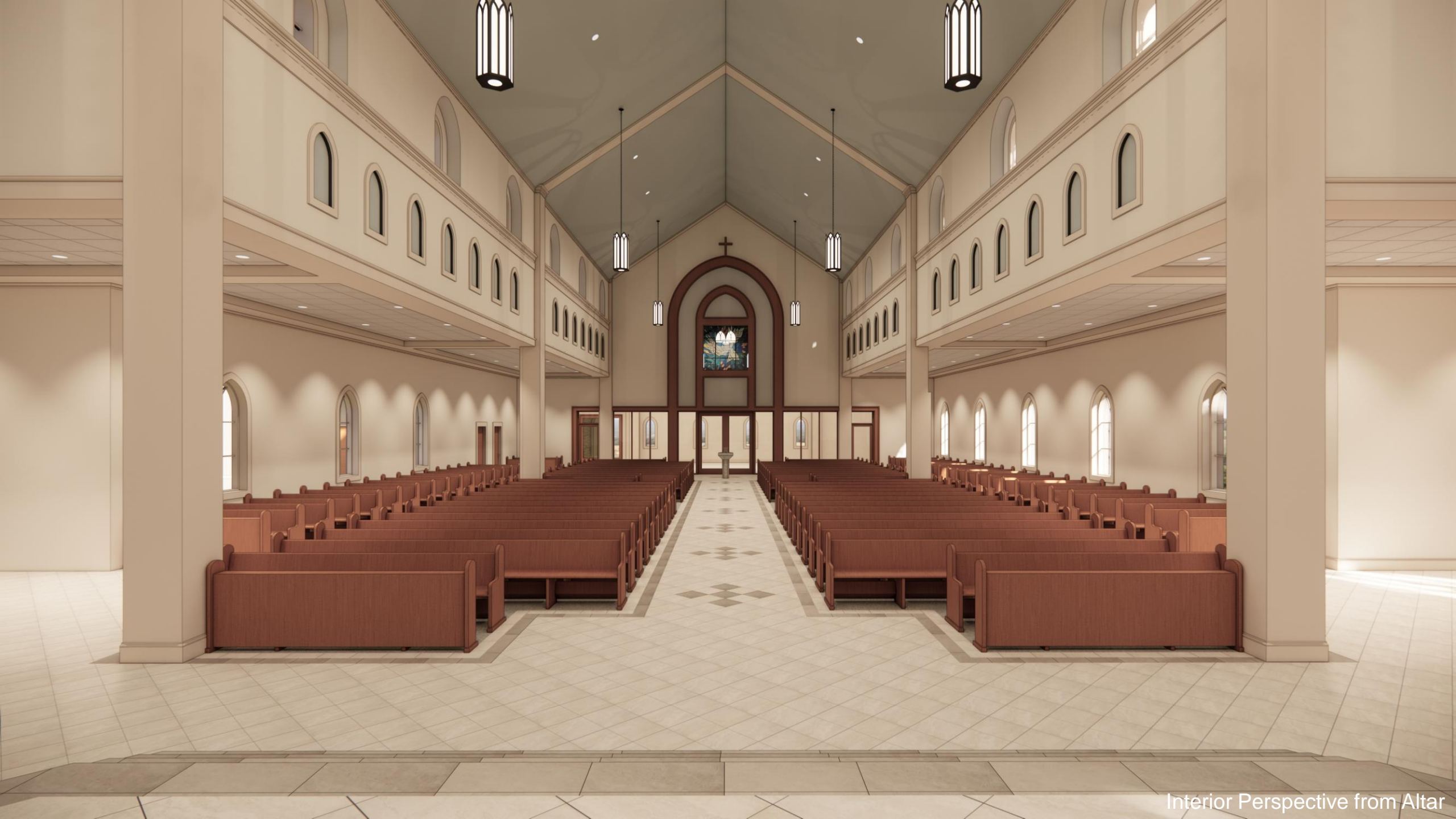
Interior Perspective from Altar