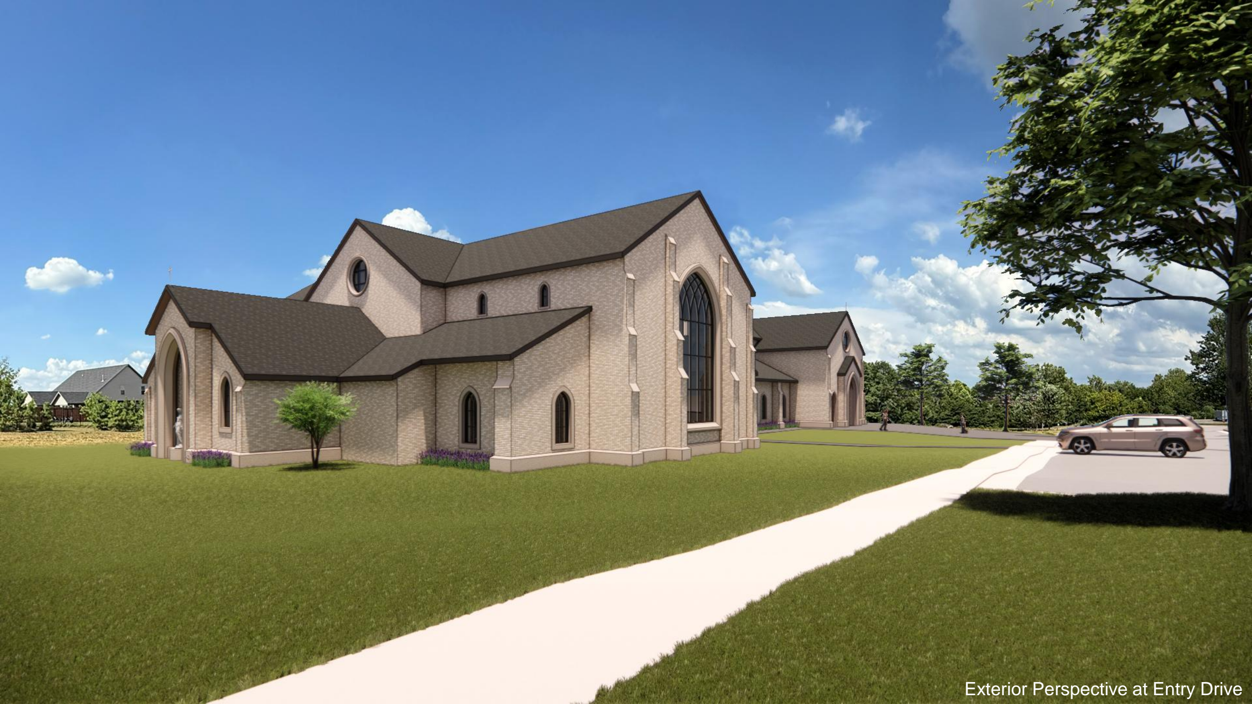
Exterior Perspective at Entry Drive