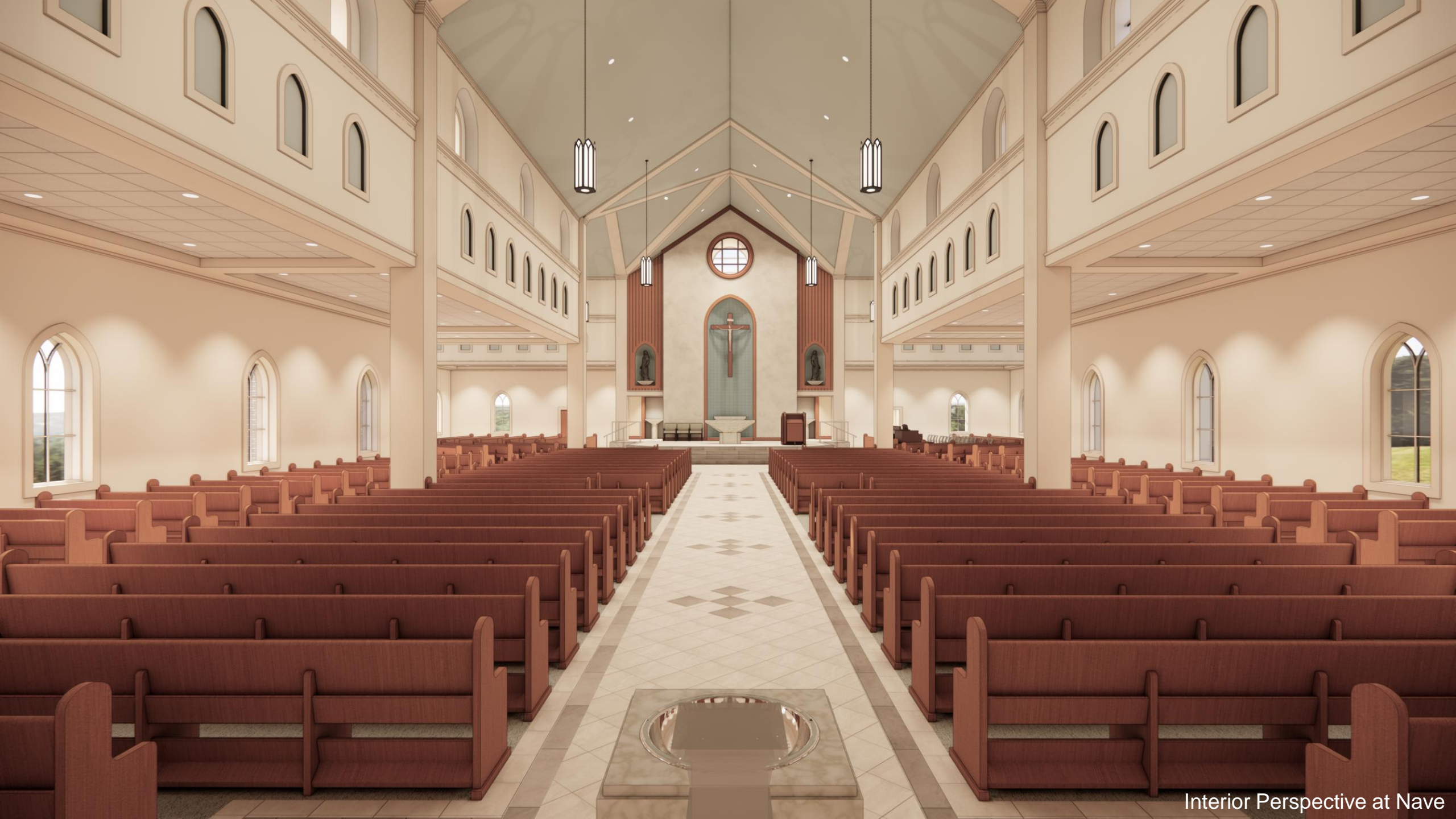
Interior Perspective at Nave