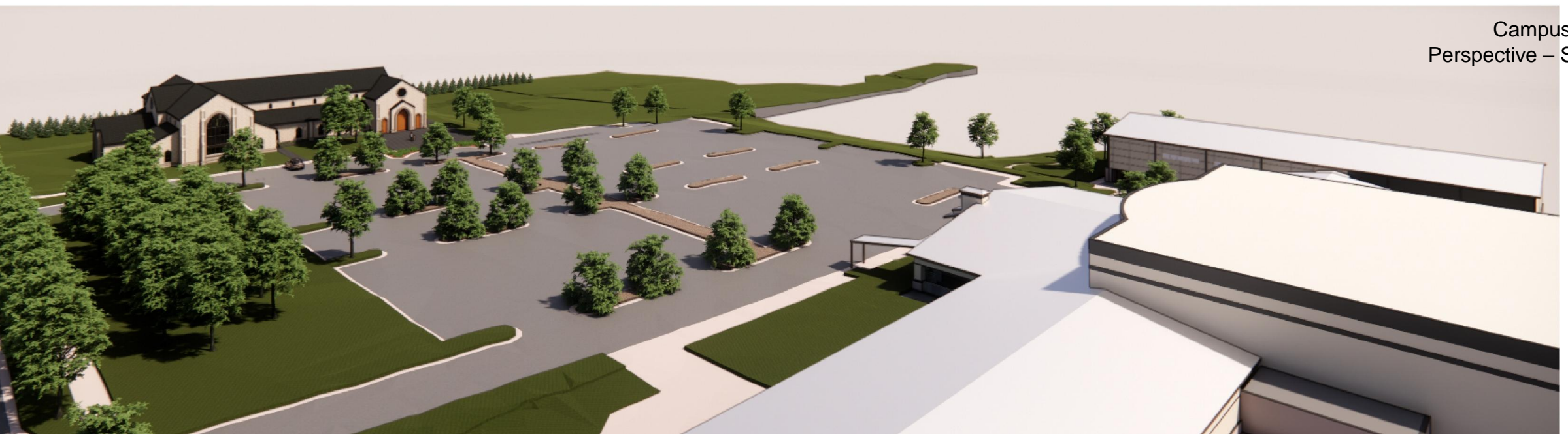
Campus Birdseye Perspective – Southwest