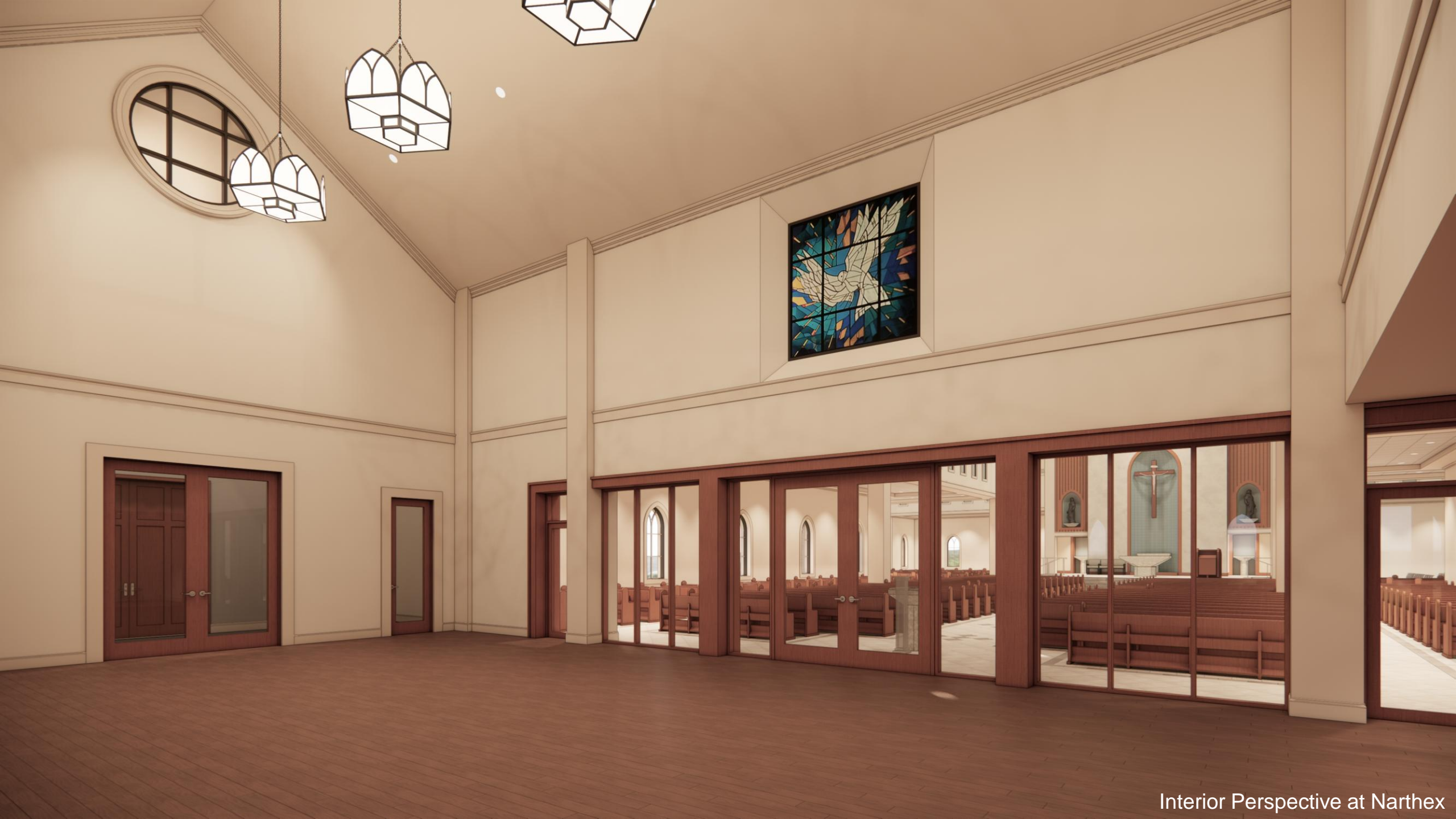
Interior Perspective at Narthex