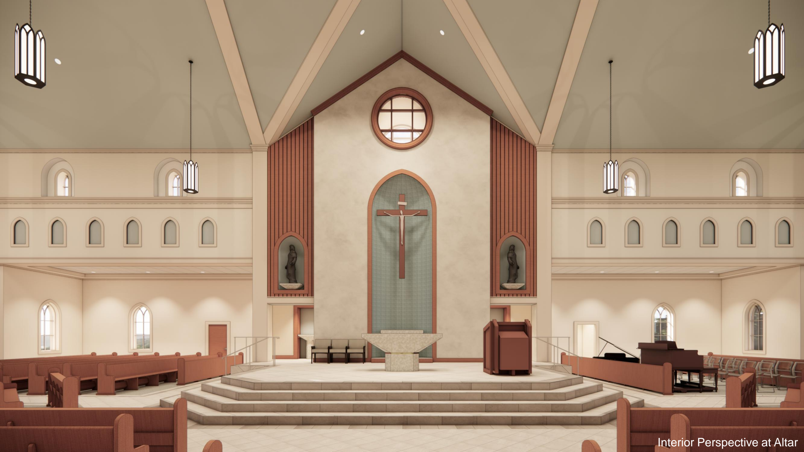
Interior Perspective at Altar