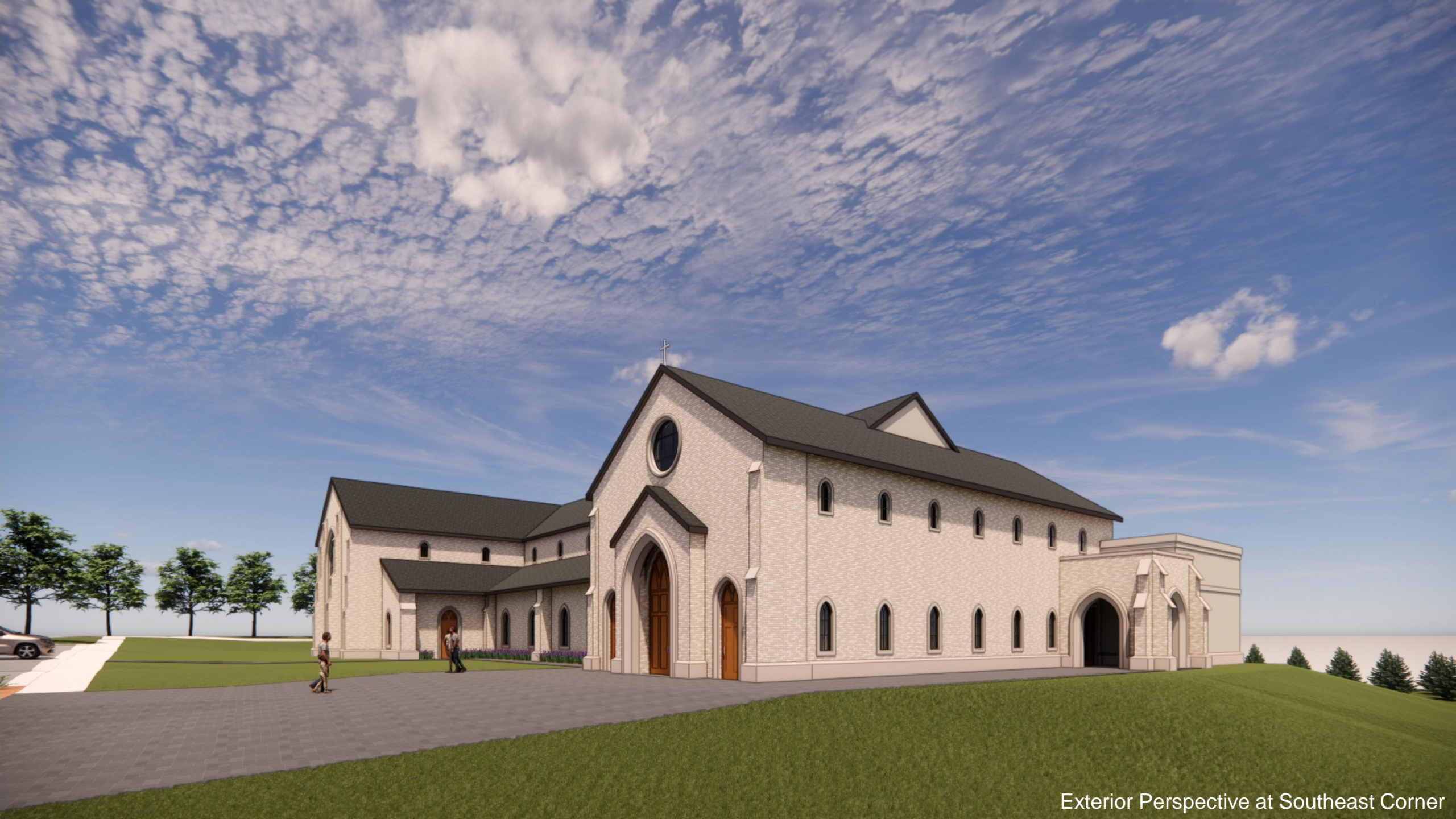
Exterior Perspective at Southeast Corner